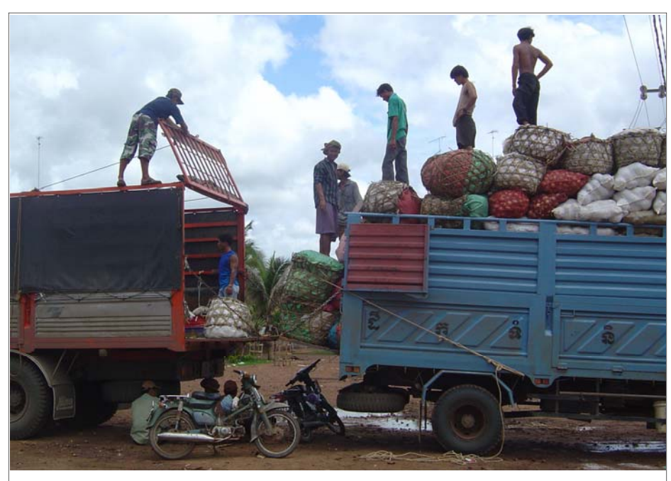
Cargo transshipping into Cambodia at a checkpoint on the Cambodia-Vietnam border.

but still has a long way to go. The region is close to China—a fact that is viewed with interest and some trepidation. The sub-region is also close to major economies like Malaysia and Indonesia, which expect very large gains from economic cooperation through broadening and deepening of markets, transfer of skills, ideas and technology and FDI flows. The CLTV countries are committed to regionalism and globalisation, and are keenly aware of the need to construct efficient, competitive market economies on the basis of their dynamic comparative advantages.