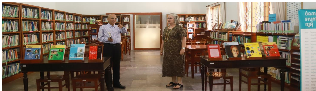
CDRI welcomes a former co-chair of its BoD.

Newsletter of the Cambodia Development Resource Institute