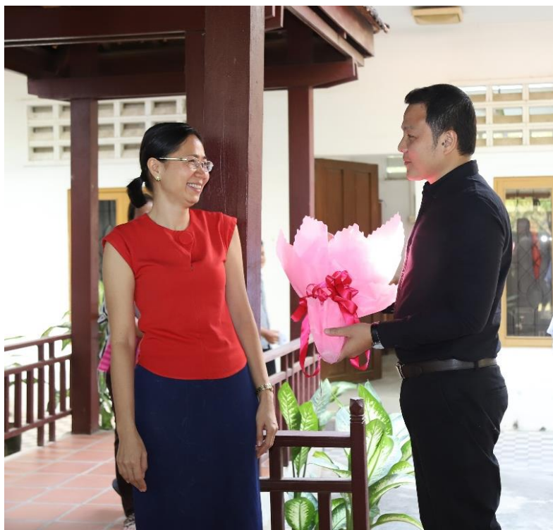
CDRI announces new director of research.