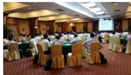
Meeting of Cambodia researchers (Higher Learning Institutions, Gov. Research Institutes, Privates, NGOs)