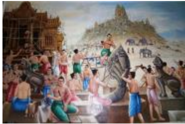
Let's say we started here