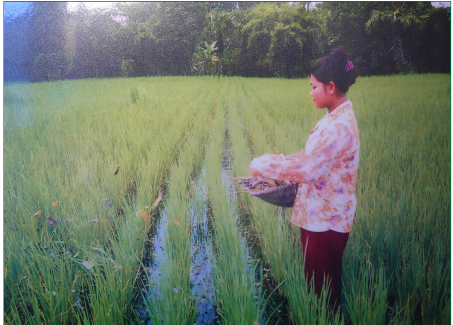
Farmers growing organic rice in Takeo province, 2006

Cambodia's economy continued to perform remarkably well in 2006. Real gross domestic product (GDP) increased by 10.6 percent in 2006, the third consecutive year of double digit growth. It was, however, down from 13.6 percent growth in 2005 due to slower growth in agriculture, as shown in Chart 1 and Table 1. Per capita GDP increased to 1718 m riels ($419) in 2006, an 8.2 percent increase from 2005. The growth impetus came mainly from the industry sector, reflecting substantial increases in garments and construction, and from the services sector,