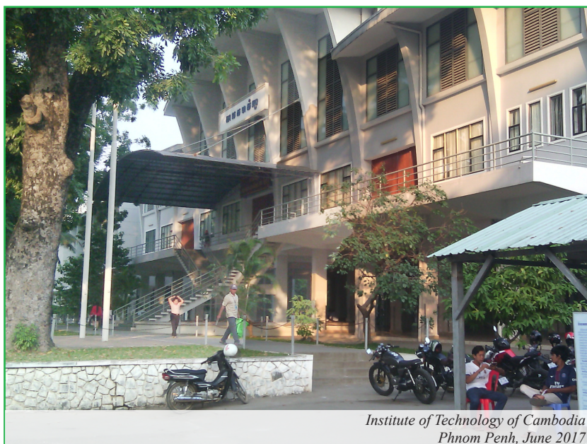
Institute of Technology of Cambodia Phnom Penh, June 2017