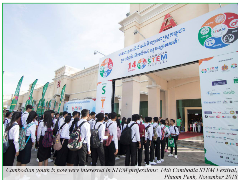
Cambodian youth is now very interested in STEM professions: 14th Cambodia STEM Festival, Phnom Penh, November 2018

As in other countries, efforts to promote STEM education and professions in Cambodia have been largely linked to the increasingly vital role of science and technology in society, as set out in key national plans, strategies and policies. One such pivotal policy document is Industrial Development Policy 2015–25, launched in 2015, which aims to