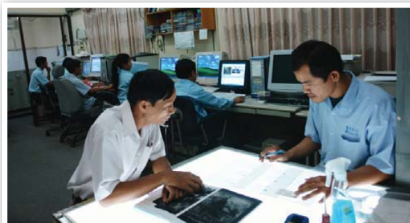
Direct quality control at a printing house, Phnom Penh, November 2007

This year CDRI published four issues of Cambodia Development Review , 12 issues of Flash Report on the Cambodian Economy , the Annual Development Review 2007–08 , three working papers, five special reports and five policy briefs. The publishing programme also provides support services in the production of video materials on CDRI activities for TV.