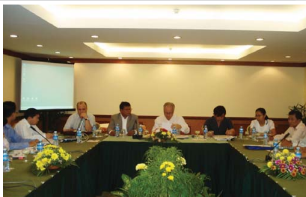
Management-senior staff retreat for mid-term Strategic Plan review, April 2008