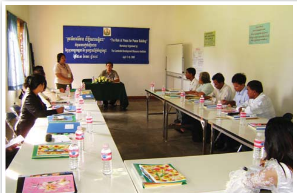
ពិធីបើកវគ្គបណ្តុះបណ្តាលស្តីពី "តួនាទីសារព័ត៌មានក្នុងការកសាង សន្តិភាព" នៅវិទ្យាស្ថាន CDRI ខែមេសា ២០០៨

CDRI បានធ្វើការសើទើពិនិត្យពាក់កណ្តាលអាណត្តិលើផែនការ យុទ្ធសាស្ត្រ ២០០៦-១០ របស់ខ្លួន ដែលមានជាអាទិ៍ ការ ត្រួតពិនិត្យលទ្ធផលការងាររៀបចំនិងផែនការ បំណុបត្រូវធ្វើ បច្ចុប្បន្នភាព និងកែតម្រូវតាមការប្រែប្រួលកាលៈទេសៈ អង្កេតពីការពេញចិត្ត/ឥរិយាបថបុគ្គលិក ការសើទើពិនិត្យ គោលការណ៍សំរាប់ធ្វើបំណាច់ថ្នាក់បុគ្គលិក ផ្តល់បៀវត្សរ៍ និង ជ្រើសរើស/រក្សាទុកបុគ្គលិក ហើយនិងការសើទើពិនិត្យ ពីតួនាទីនិងទំនួលខុសត្រូវនៃការគ្រប់គ្រងថ្នាក់កណ្តាល ។