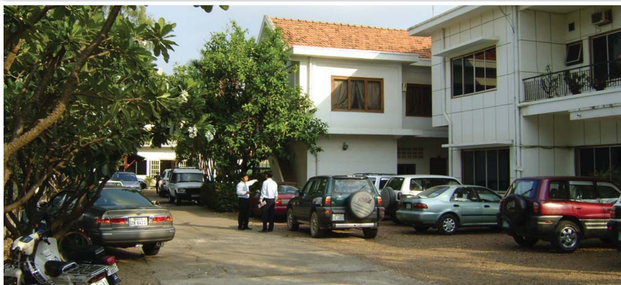
CDRI's main building: view from the front gate

Located in the Phnom Penh suburb of Tuol Kork, CDRI has 74 staff including management, professional and technical staff, administrative and support staff, of whom 69 are Cambodian. CDRI has a strong commitment to the capacity development and professional skills of its staff, many of whom, after being trained at CDRI, go on to contribute to other Cambodian and international organisations involved in their country's development.