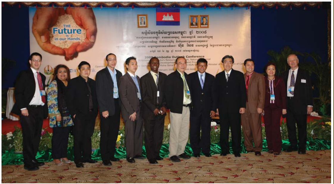
សន្និសីទចក្ខុវិស័យប្រទេសកម្ពុជា ឆ្នាំ២០០៨ វគ្គទី ៥: រូបថតអនុស្សាវរីយ៍របស់អ្នកចូលរួមមួយចំនួន 2008 Cambodia Outlook Conference, Session 5: Photo souvenir of some participants

តំលៃឡើងវិញ ពីកម្មវិធីបណ្តុះបណ្តាលការកសាងសន្តិភាព និងការបំប្លែងទំនាស់ និងទិសដៅទៅអនាគត ដោយមានផ្តល់ អនុសាសន៍សំរាប់អោយវិទ្យាស្ថាន CDRI ពិចារណាផ្ទៃក្នុង និង សុំយោបល់ពីក្រុមប្រឹក្សាភិបាលនៅខែសីហា ២០០៨ ដើម្បី ដាក់អនុវត្តជាបណ្តើរៗក្នុងឆ្នាំ២០០៨-១០ ។