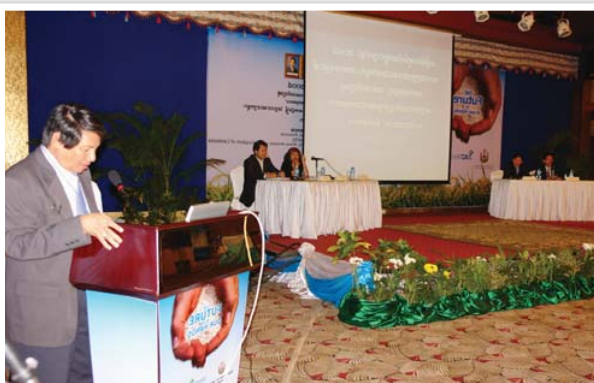
Session 2: Presentation by Chan Tong Yves, secretary of state, Ministry of Agriculture, Forestry and Fisheries