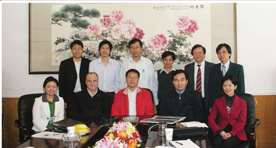
Workshop to discuss preliminary findings of DAN project on agricultural trade in the GMS in Kunming, Yunnan province of China, April 2008

In September 2007, CDRI and the Community Based Natural Resource Management Learning Institute (CBNRMLI) co-hosted an IDRC All Partners Forum in Phnom Penh, bringing together all Cambodian agencies supported by IDRC. As a result, a proposal for better networking of Cambodian researchers and research capacity building was accepted by IDRC, for the establishment