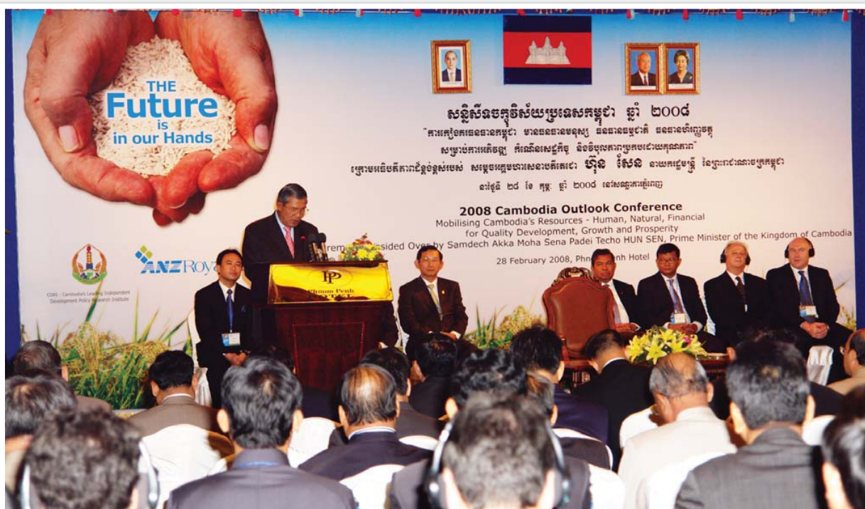
Prime Minister Hun Sen delivering his keynote address to the Cambodia Outlook Conference, February 2008

Prime Minister Hun Sen, in his keynote opening address, emphasised that a decade of peace