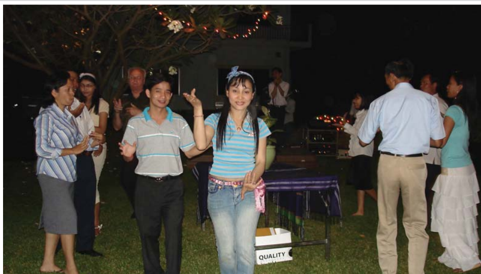
Year-end party for all CDRI staff, CDRI garden, 2007