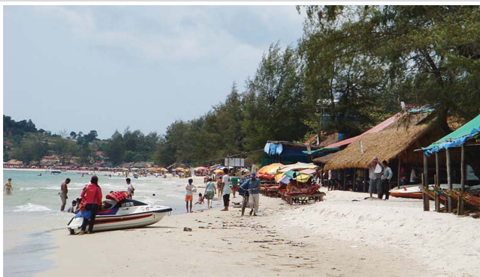
Local visitors enjoying their holiday at the beach in Sihanoukville

of a Development Research Forum, co-hosted by CDRI and CBNRMLI, over 2008–10.