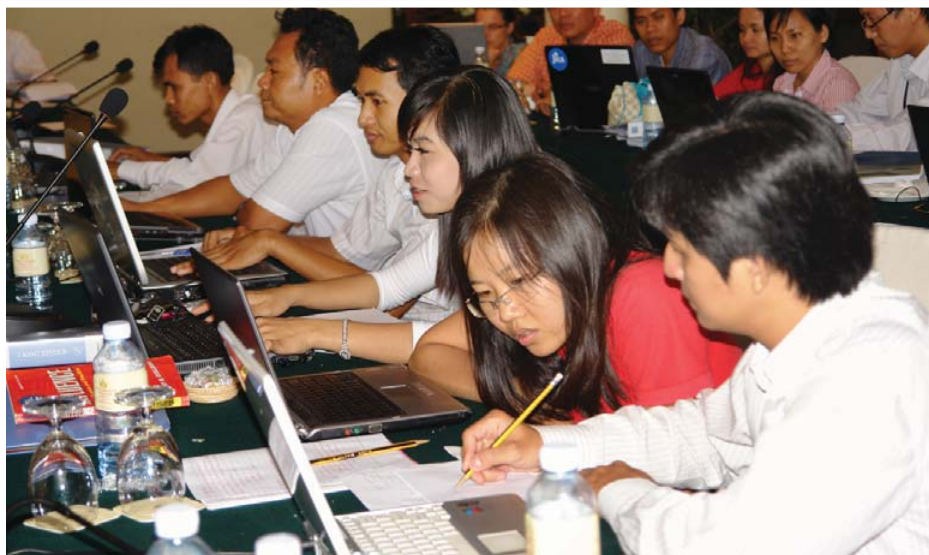
CDRI staff attend MOPS training, June 2008

DATES COURSE TITLE PROVIDED BY SPEAKER/ INSTITUTION 2–3 April 2007 Qualitative Data Analysis Centre for Forest, Landscape and Planning, Copenhagen University, Denmark 9,16 & 23 May 2007 Cost Benefit Analysis EEPSEA 24–29 Aug. & 3–6 Sept. 2007 Research Concepts and Methods University of Sydney