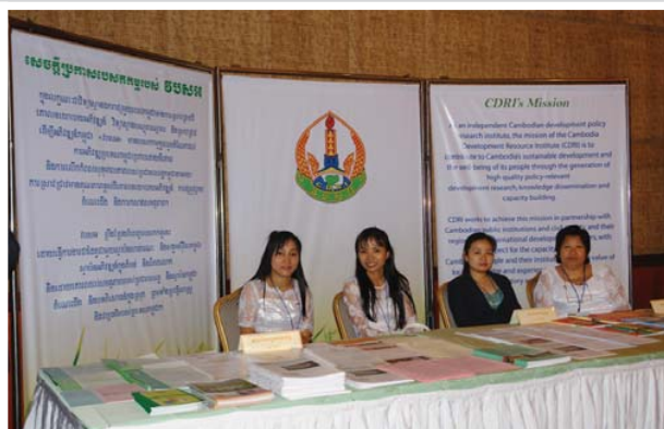
Display of CDRI products at Cambodia Outlook Conference, Phnom Penh, February 2008