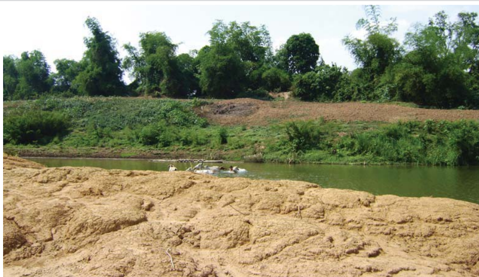
In the dry season the water is very low in the river and very costly to bring to the field, Kompong Cham, February 2008

COPCEL has proven a useful forum for the discussion of issues such as voter registration, the distribution and checking of voter information, review and "cleaning" of voter lists, the role and behaviour of local officials, complaint handling policy and procedures of the National Election Committee and the behaviour of political parties.