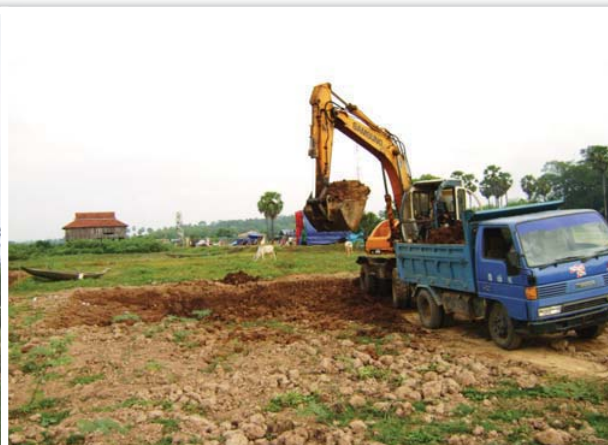
Digging a pond to store water for household use and seed bed supplementary irrigation, Kompong Cham, February 2008