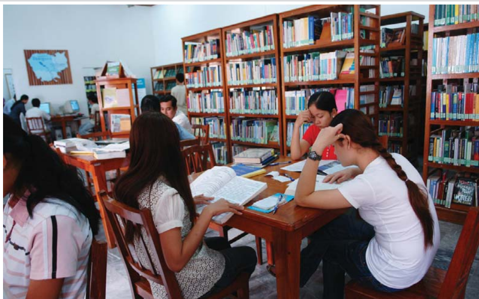
Users of CDRI's library and Tonle Sap Initiative Learning Resource Centre

Research knowledge and resources published in Cambodia have been unavailable in catalogues of almost all libraries, including the Library of Congress. CDRI librarians have been working to catalogue such titles to make the most complete list covering development policy research fields of interest. The cataloguing of local publications is progressing and expected to be completed in the third quarter of 2008.