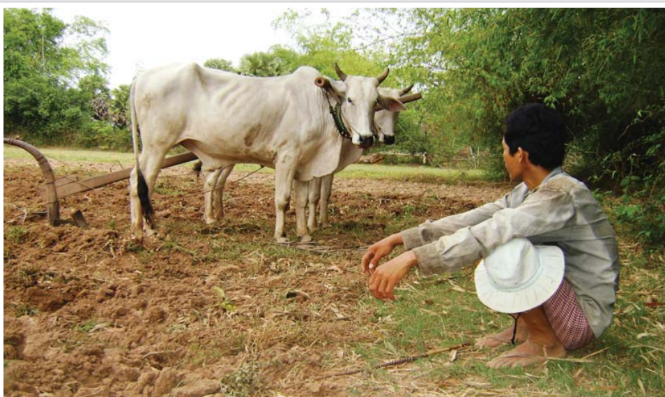
Draught animals are still very much in use in Cambodia: a short break after the early morning plowing, Kompong Cham, February 2008

The cost of energy and options for its local generation are major priorities for the Cambodian government and its development partners and private sector investors. The Natural and Social Environment Survey for the Master Plan Study of Hydropower Development in Cambodia, undertaken by CDRI, is a three-month survey funded by JICA. The initial field visit and questionnaire testing were done in Stung Treng province from 15 to 17 November 2007. The survey, involving 800 households in 26 villages in Koh Kong, Pursat, Kampot, Ratanakkiri and Stung Treng, was conducted in January 2008, with the report now completed and submitted.