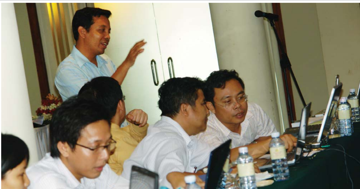
CDRI’s staff participating in a training course, June 2008

In April 2008, CDRI held a one-day management and senior staff retreat at the Phnom Penh Hotel to identify and discuss the major issues to focus on in the mid-term review of the 2006–10 Strategic Plan, and what it is hoped to achieve from it. The retreat provided interactive sessions on research product quality, management and policy impact, changes in CDRI in a changing environment and challenges from the board of directors that need to be addressed. The retreat assessed areas of strength and identified areas for further improvement, on which management and staff will act together over the life of the current Strategic Plan.