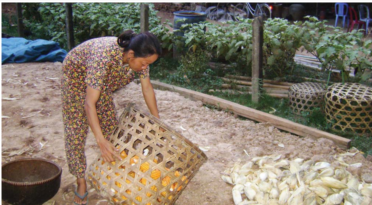
Putting the newly harvested corn to dry, Kompong Cham province, February 2008

sub-national governance, or decentralisation and deconcentration, reforms. They continue to be a major focus of research and policy attention for CDRI, which built strong capacity on these issues during its PORDEC programme over 2004–06. Drawing on this experience, and with support from Sida and DFID, CDRI in 2007 designed and initiated the Ke'chhnay programme of research, publishing, policy influencing and research capacity building on current democratic governance issues.