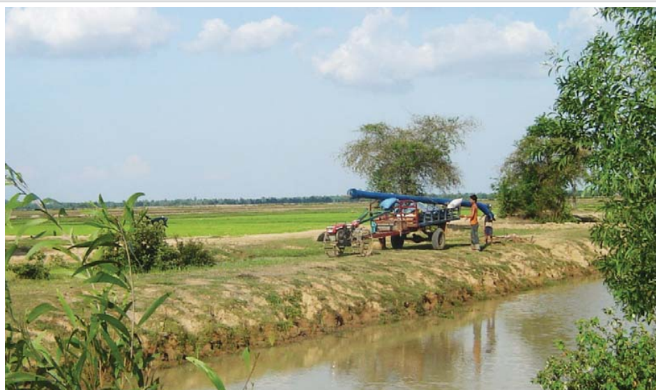
With an irrigation canal nearby, a small farmer can easily water his rice crop, Battambang province, May 2007