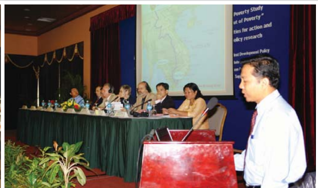
Land Titling Baseline Survey: Rural and Urban Phases Dissemination Workshop, Phnom Penh, October 2007