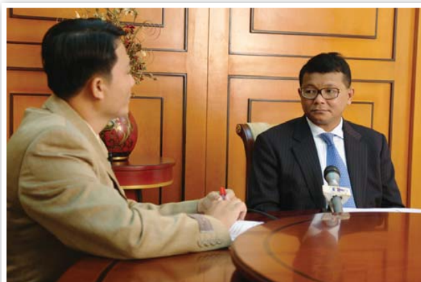
Dr Hang Chuon Naron gives an interview with CTN and TVK channels prior to 2008 Outlook Conference