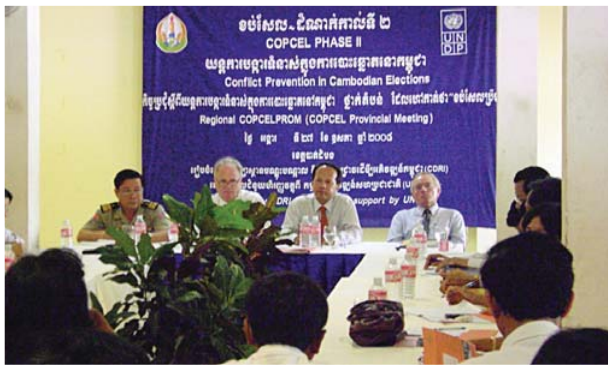
យន្តការបង្ការទំនាស់ក្នុងការបោះឆ្នោតនៅកម្ពុជា-ដំណាក់កាលទី ២៖ កិច្ចប្រជុំថ្នាក់តំបន់នៅខេត្តបាត់ដំបង ខែឧសភា ២០០៨ Conflict Prevention in Cambodian Elections: a regional meeting in Battambang, May 2008

សន្និសីទបក្សវិស័យប្រទេសកម្ពុជាឆ្នាំ២០០៨ ដែលរៀបចំឡើងដោយវិទ្យាស្ថាន CDRI និងធនាគារ ANZ Royal បានប្រារព្ធឡើងនៅទីក្រុងភ្នំពេញ កាលពីថ្ងៃ ២៨ ខែកុម្ភៈ ឆ្នាំ២០០៨ ។ សន្និសីទលើកទី ២ នេះ គឺជាកិច្ចសហការជាដៃគូរវាងវិទ្យាស្ថានស្រាវជ្រាវឈានមុខគេខាងគោលនយោបាយអភិវឌ្ឍន៍ និងធនាគារឈានមុខគេ ។ សន្និសីទបានអញ្ជើញអ្នកដឹកនាំជាង ២៥០នាក់ពីខាងរាជរដ្ឋាភិបាលកម្ពុជា វិស័យឯកជន សង្គមស៊ីវិល និងសហគមន៍ស្រាវជ្រាវនិងអភិវឌ្ឍន៍នានា មកចូលរួមពិភាក្សាពីវឌ្ឍនភាព និងបញ្ហាប្រឈមក្នុងការអភិវឌ្ឍប្រទេសកម្ពុជា ដោយសង្កត់ធ្ងន់លើបញ្ហាពាក់ព័ន្ធជាមួយវិស័យឯកជន ដើម្បីកសាងអនុសាសន៍ខាងគោលនយោបាយ និងផ្តល់មតិសំរាប់ការធ្វើសកម្មភាព ។